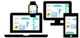
available on any device