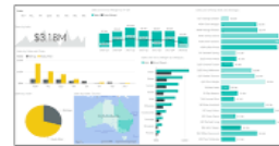
stunning interactive visuals

Pivot Table Slicer in Pivot Table Power Pivot Power Pivot Function Total Duration 25 H 2 Month Mon-Fri - 1 Hours or Sat-Sun 2H Power Query SQL Query in Power Query